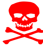
Table of Pesticide Label Signal Words & Relative Toxicities